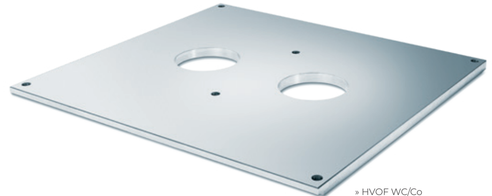
» HVOF WC/Co