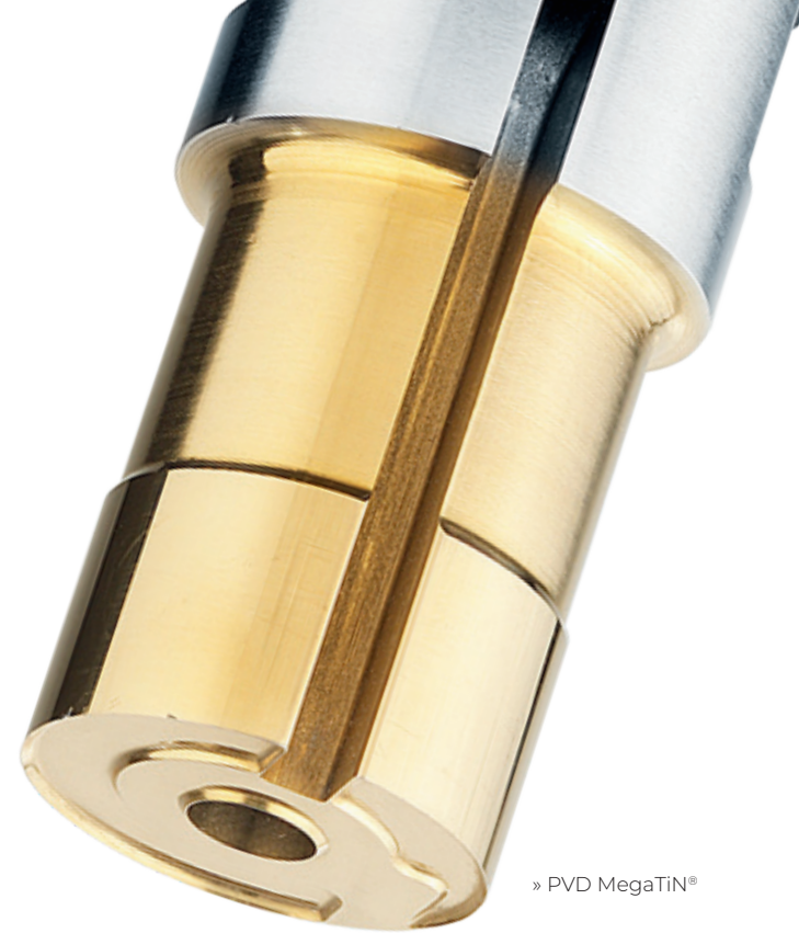
» PVD MegaTiN®